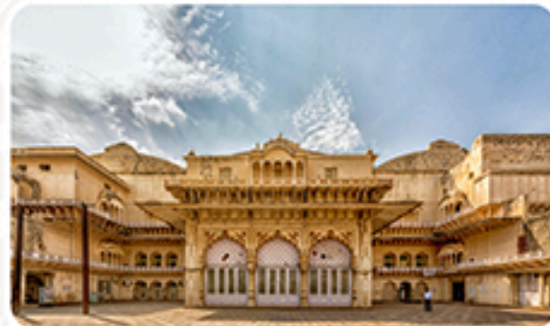
CITY PALACE AND SANGRAHALAYA