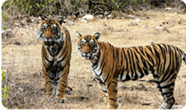
SARISKA TIGER RESERVE