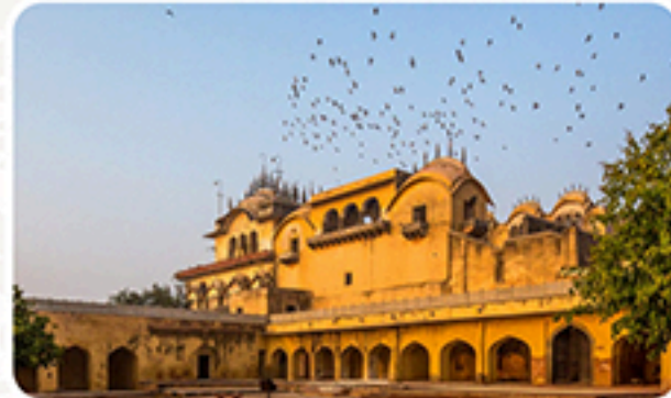
BALA QUILA ALWAR