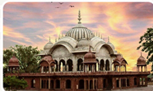
MOOSI MAHARANI KI CHHATRI